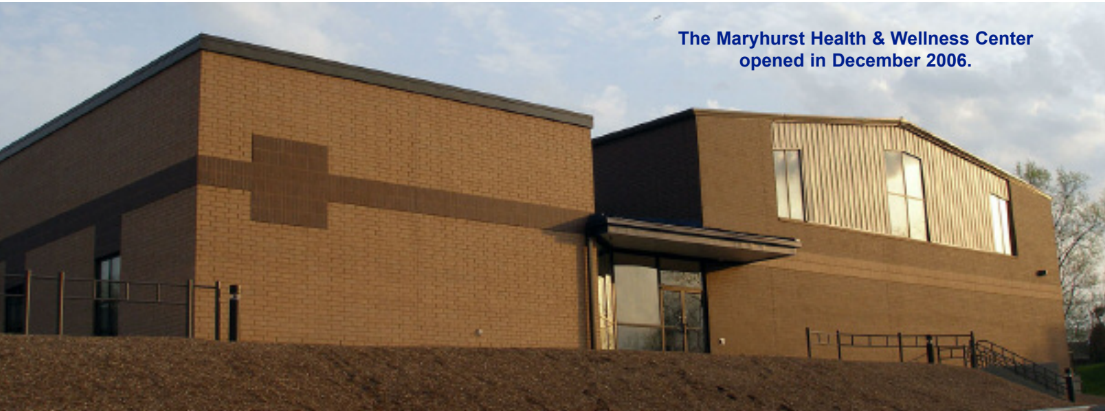
The Maryhurst Health & Wellness Center opened in December 2006.