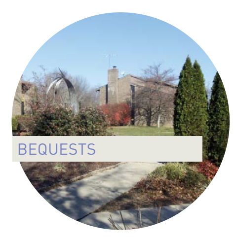
Agnes Masonis Charitable Trust